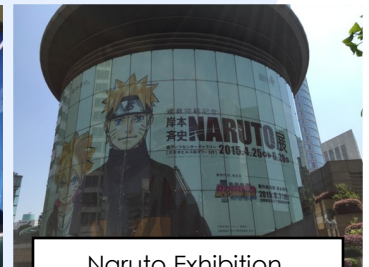
Naruto Exhibition, Mori Art Tower