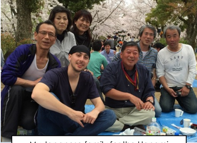
My Japanese family for the Hanami